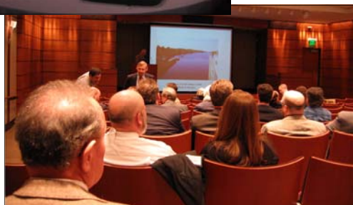
Friday night's reception and plenary session were held at Southern Progress Corporation's headquarters, home to Time Warner publications such as Southern Living , Cooking Light and Cottage Living magazines, among others.