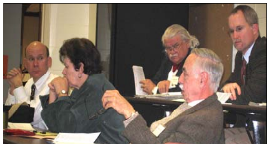
Paper sessions (top) were well-attended at this year's annual meeting, hosted by the Samford University Department of History.